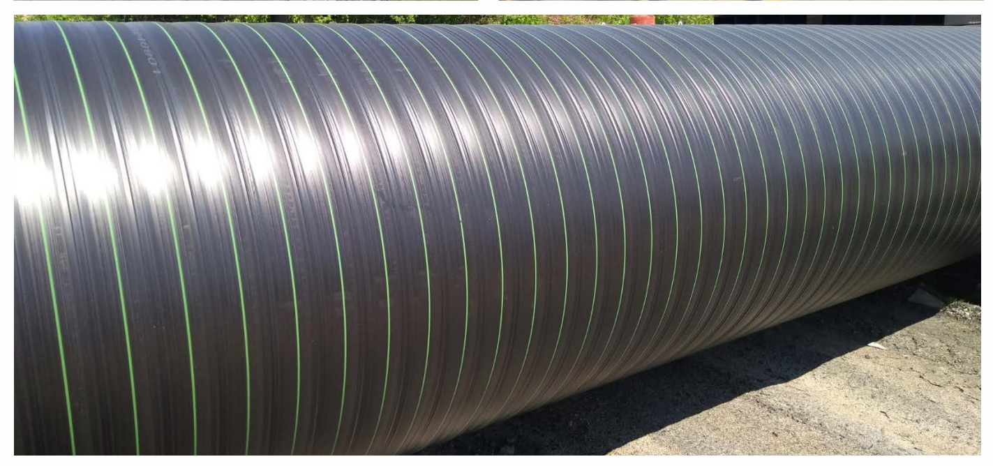
11|Engineered Systems General Information Brochure