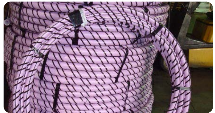
Figure 2 - EndoTrace Blue Tubing (left) and Lavender Tubing (right)